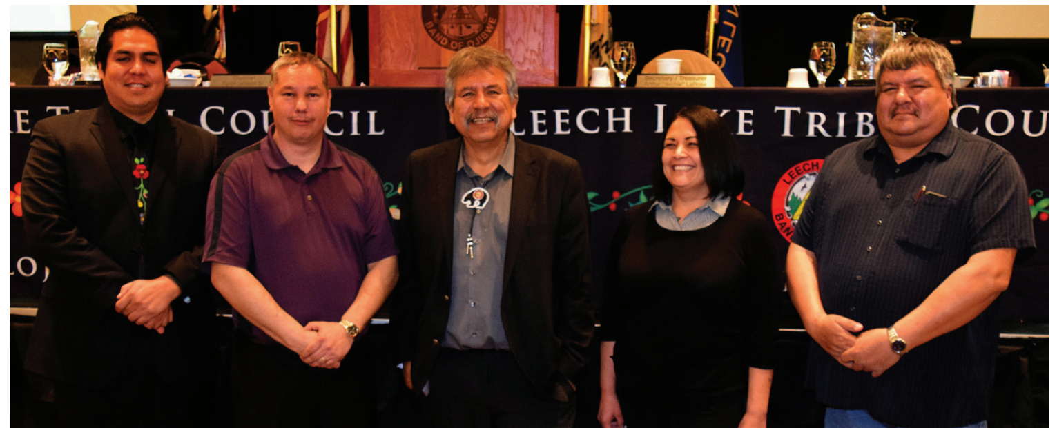
The Leech Lake Tribal Council pauses for a quick photo immediately following the Chairman's Address.