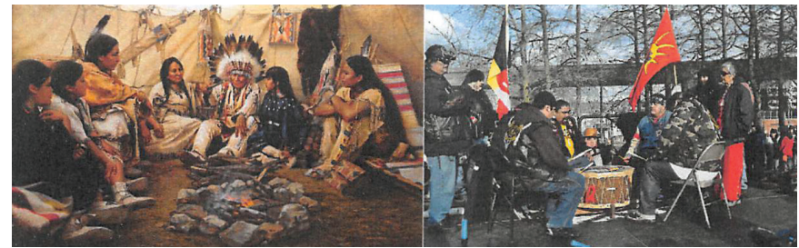
Yesterday's Warriors ————— 2018 ————— Today's Warriors

----Listen----Learn----Language----Laugh----Love----